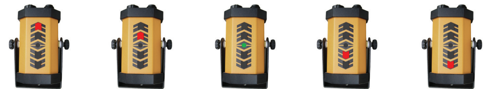
Below Grade (move up) >2" Below Grade (move up) <2" On Grade Above Grade (move down) <2" Above Grade (move down) >2"

Similar to the laser detector, the remote display will flash to indicate grade as follows: